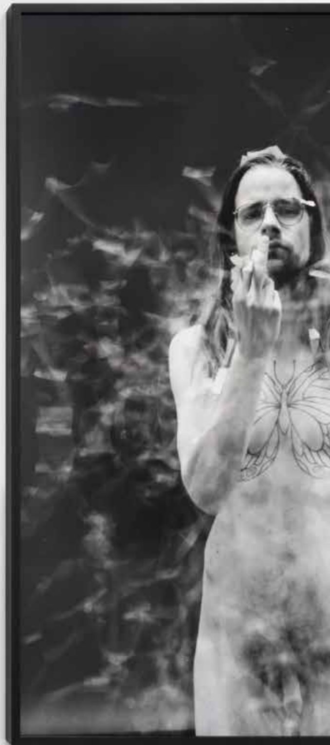
Half life body scan, 2022 Analog silver gelatin print Size: 240 x 150 cm, Edition: Unique