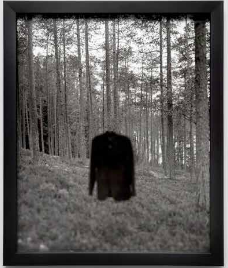
Self portrait with a parished friend II, 2021 Analog silver gelatin print, framed with museum glass