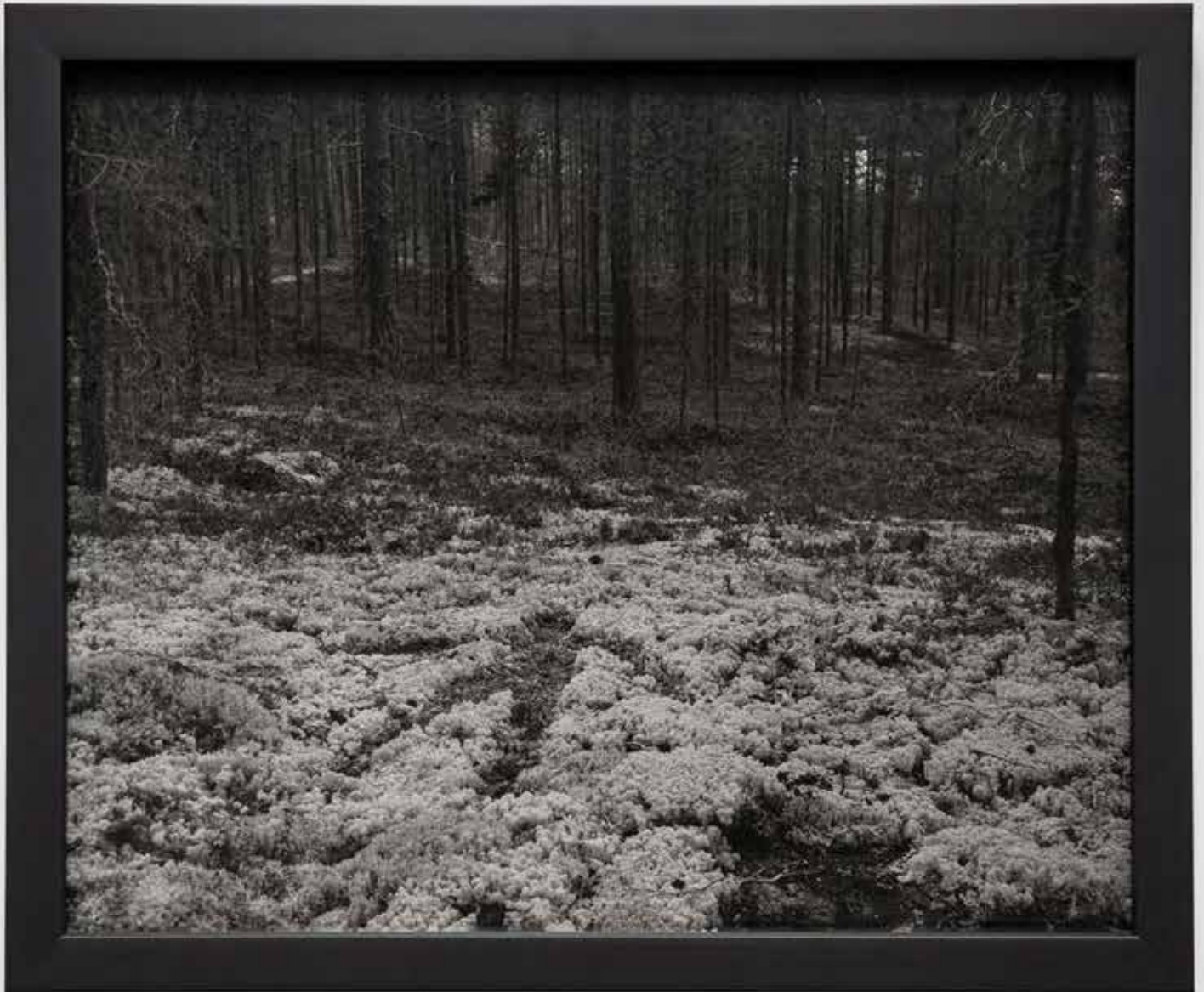
Ja inte kommer man till himlen 2022 Analog silver gelatin print, framed