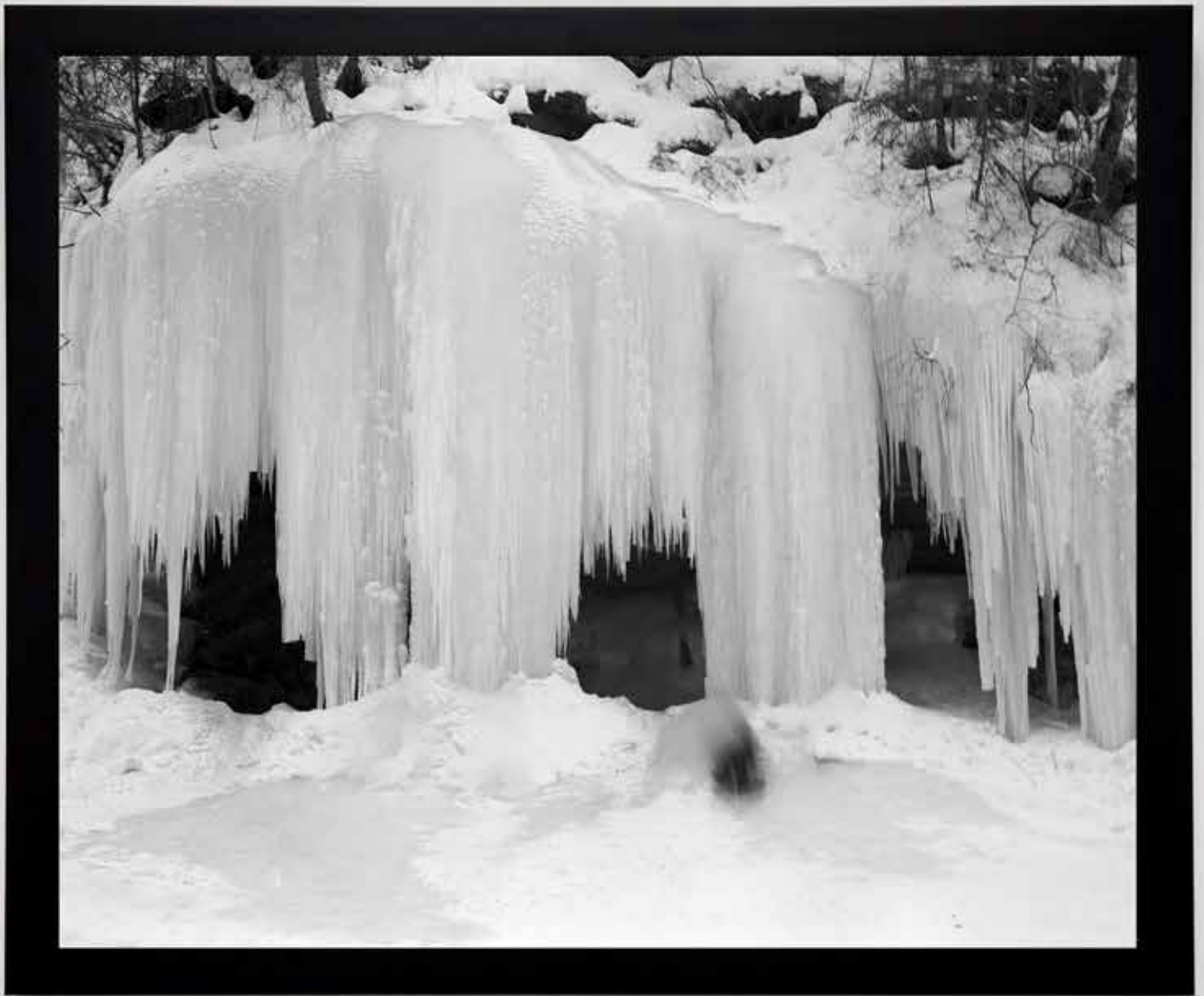
Iskjørjka, 2024 Analog silver gelatin print, framed