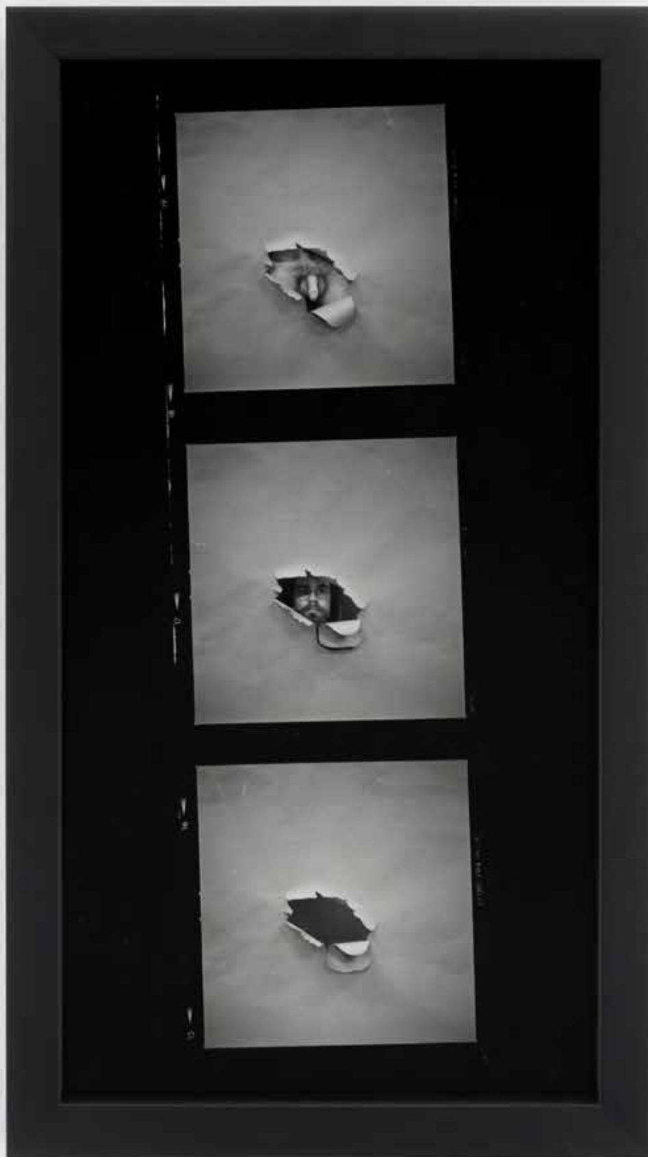
Hole, 2022 Analog silver gelatin print, framed with museum glass