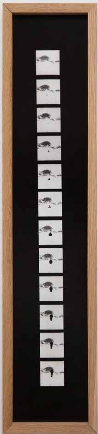
Resurrection of Charlie, 2020 Analog silver gelatin print, framed