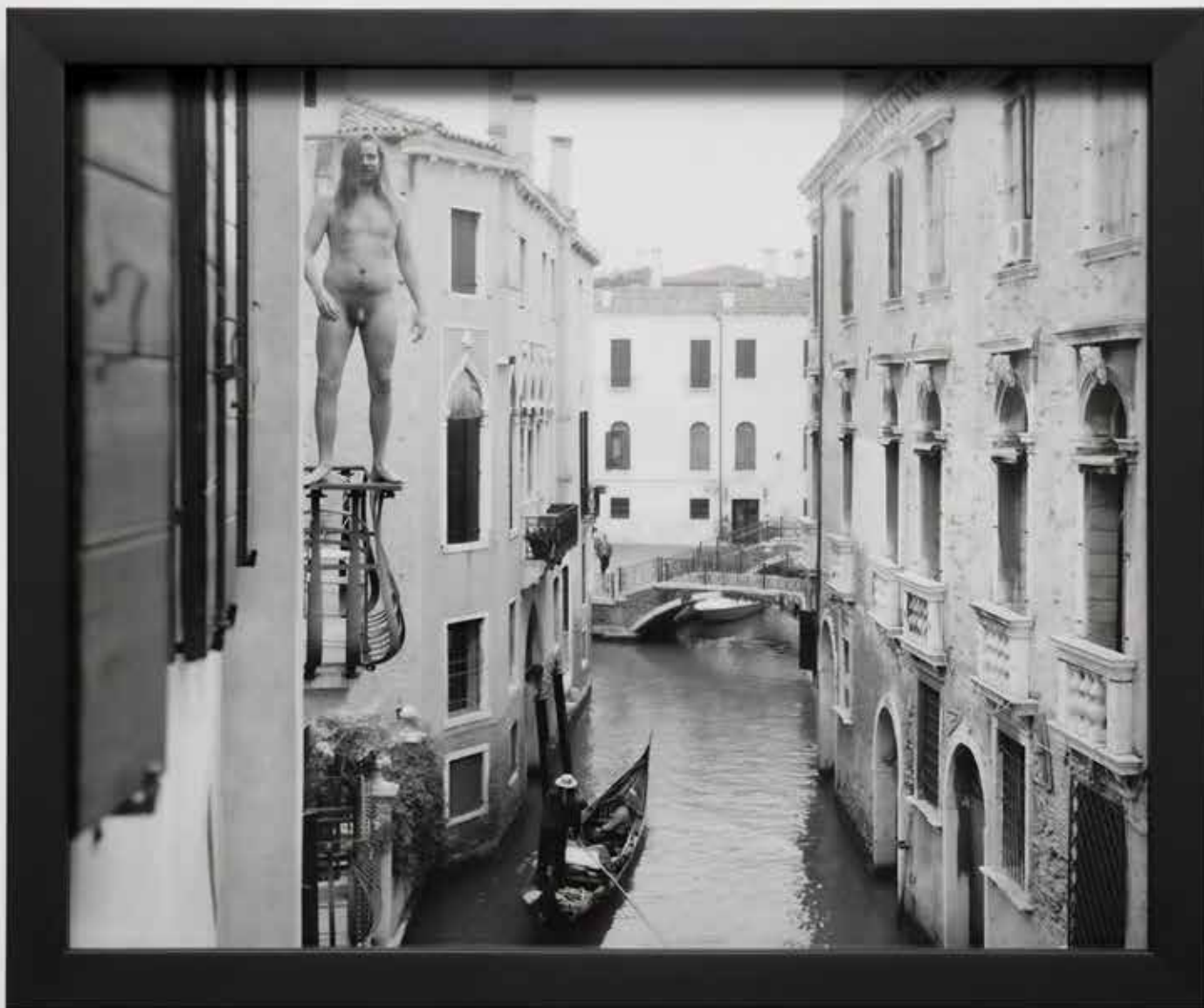
Greetings from Venice 2021 Analog silver gelatin print, framed