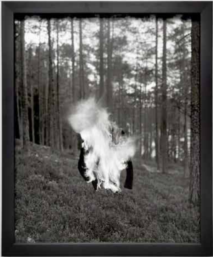
Self portrait with a parished friend, 2021 Analog silver gelatin print, framed with museum glass