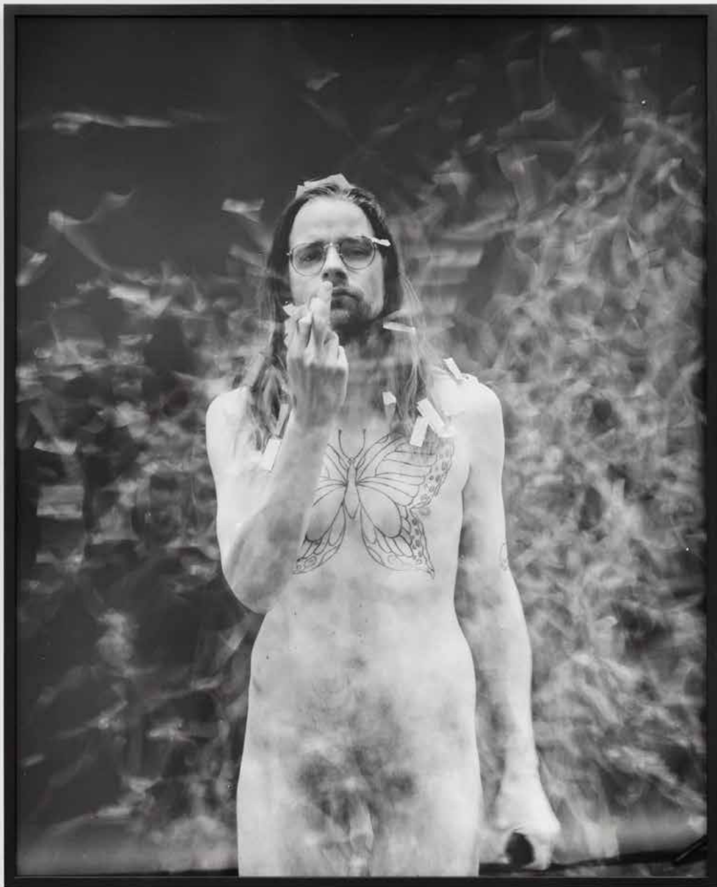
Idioterna dom vann, 2021 Analog silver gelatin print, framed