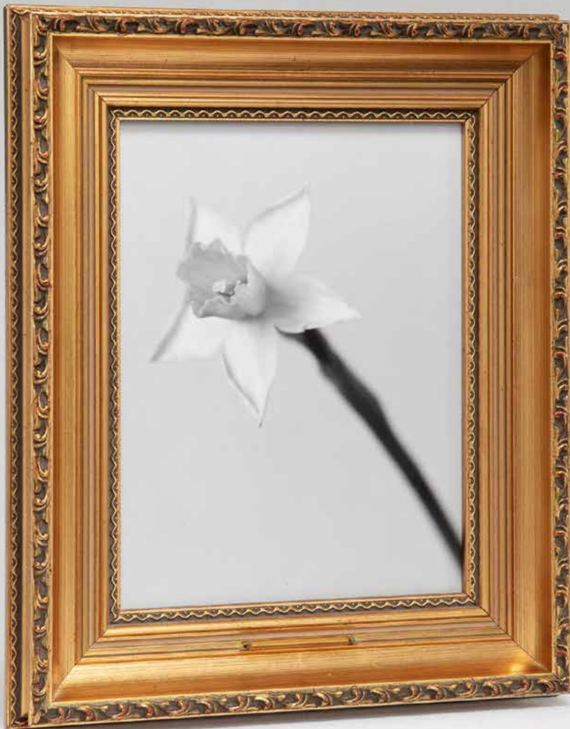
Narcissus, 2022 Analog silver gelatin print, gold leaf frame, 2 sided