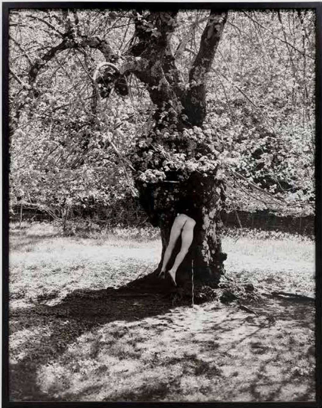
Den som inga pengar har, den får gå med rompan bar, 2021 Analog silver gelatin print, framed