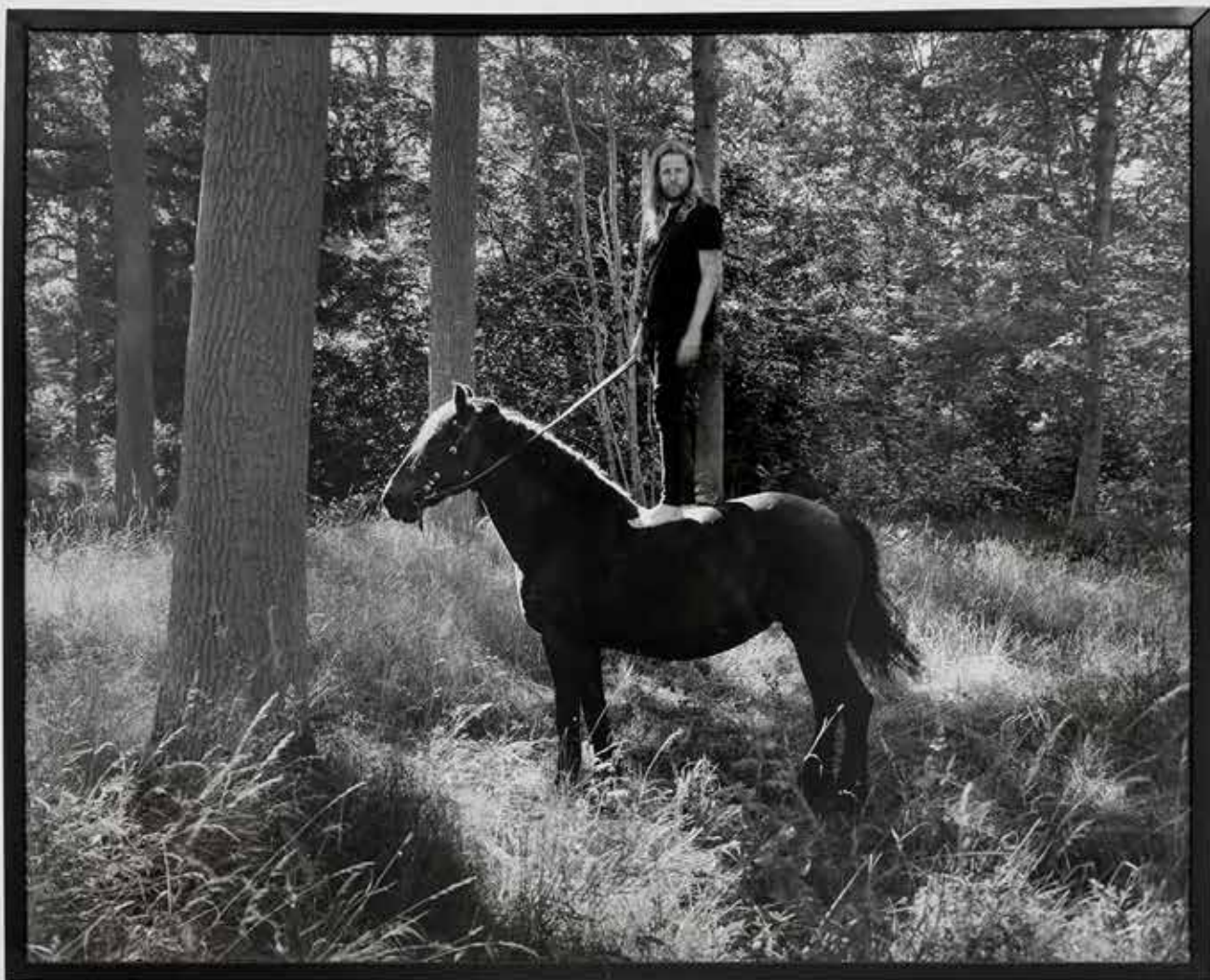
A Horse will never run you over,, 2021 Analog silver gelatin print, framed