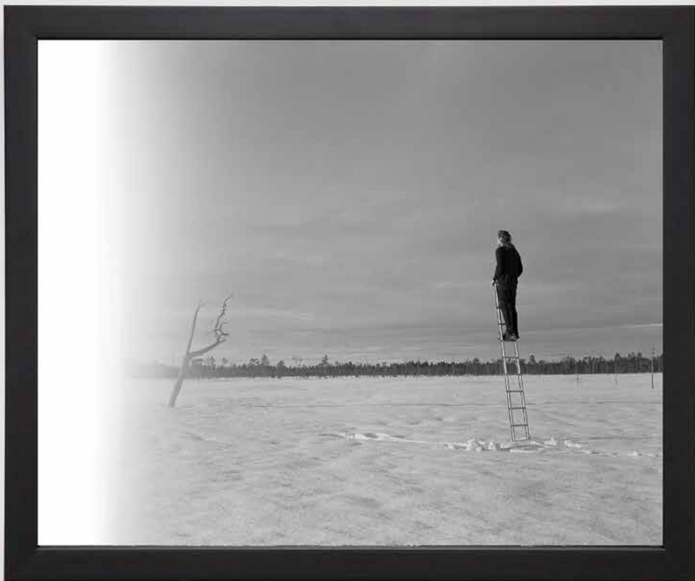
Halva världen står i brand 2024 Analog silver gelatin print, framed